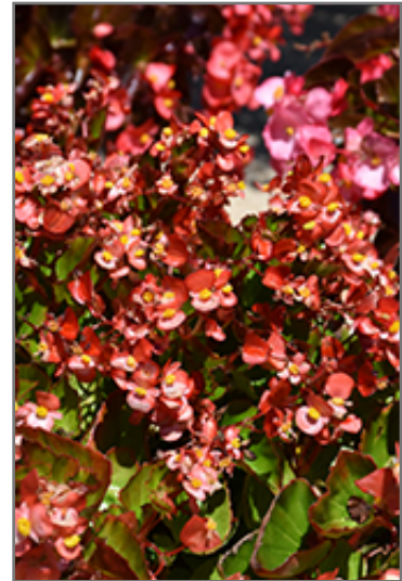
Hula Bicolor Red White Begonia flowers

Hula Bicolor Red White Begonia is an herbaceous annual with a ground-hugging habit of growth. Its medium texture blends into the garden, but can always be balanced by a couple of finer or coarser plants for an effective composition.