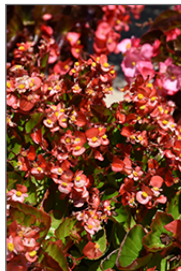
Hula Bicolor Red White Begonia flowers

Hula Bicolor Red White Begonia is an herbaceous annual with a ground-hugging habit of growth. Its medium texture blends into the garden, but can always be balanced by a couple of finer or coarser plants for an effective composition.