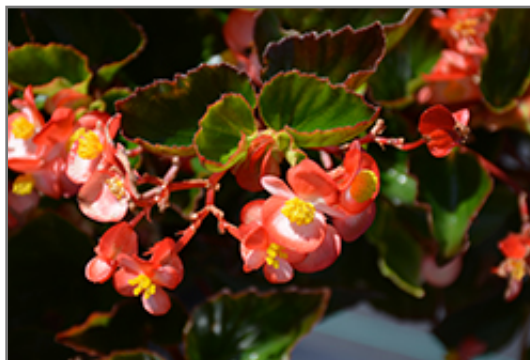
Hula Bicolor Red White Begonia flowers

Hula Bicolor Red White Begonia is a fine choice for the garden, but it is also a good selection for planting in outdoor containers and hanging baskets. Because of its spreading habit of growth, it is ideally suited for use as a 'spiller' in the 'spiller-thriller-filler' container combination; plant it near the edges where it can spill gracefully over the pot. Note that when growing plants in outdoor containers and baskets, they may require more frequent waterings than they would in the yard or garden.