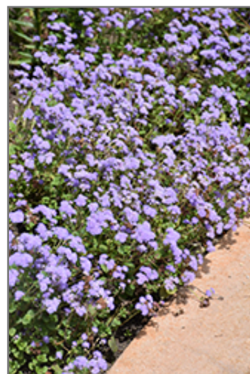
Aguilera Sky Blue Flossflower in bloom