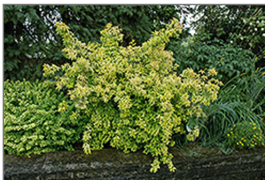
Gold Leaf Forsythia