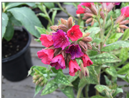
Lisa Marie Lungwort flowers