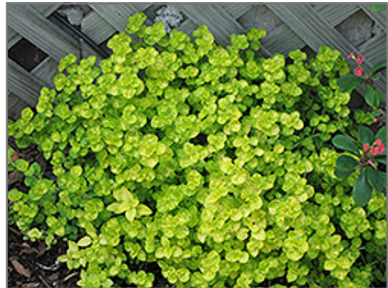
Golden Marjoram

Golden Marjoram will grow to be about 10 inches tall at maturity, with a spread of 18 inches. When grown in masses or used as a bedding plant, individual plants should be spaced approximately 20 inches apart. Its foliage tends to remain low and dense right to the ground. Although it's not a true annual, this fast-growing plant can be expected to behave as an annual in our climate if left outdoors over the winter, usually needing replacement the following year. As such, gardeners should take into consideration that it will perform differently than it would in its native habitat.