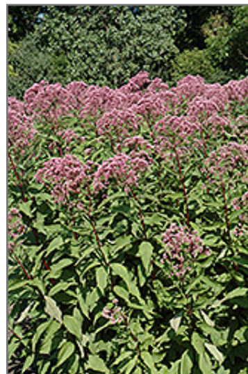
Glutball Joe Pye Weed flowers

A lovely upright perennial blooming in the summer and continuing into the fall; stunning plum colored flower plumes rise above dark green foliage; fast growing, great for woodland gardens, beds and containers; excellent for cut flower arrangements