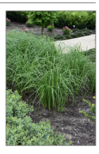
Emory's Sedge

A vigorous sedge that is valued for wetland restoration and soil retention; perfect for riverbanks, pond edges, or wet meadows; suitable for gardens or as a groundcover but must have sufficient water