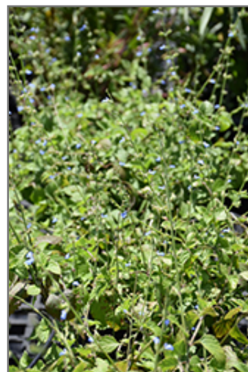
Southern River Sage flowers

Southern River Sage is recommended for the following landscape applications;