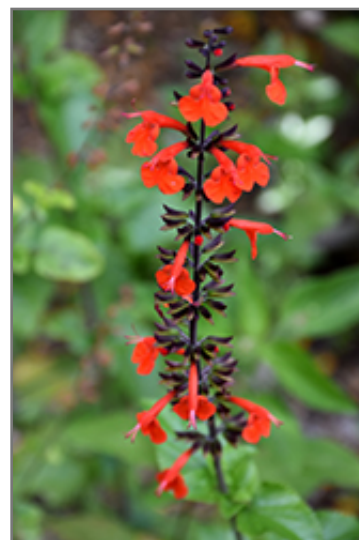
Scarlet Sage flowers

Scarlet Sage is recommended for the following landscape applications;