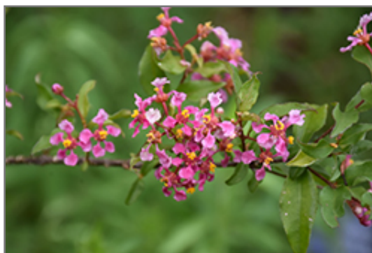
Fairchild Barbados Cherry flowers

Fairchild Barbados Cherry is recommended for the following landscape applications;