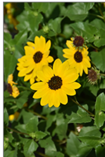
Beach Sunflower flowers

Beach Sunflower is recommended for the following landscape applications;