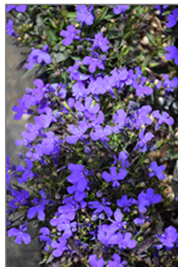
Crystal Palace Lobelia flowers

Crystal Palace Lobelia is recommended for the following landscape applications;