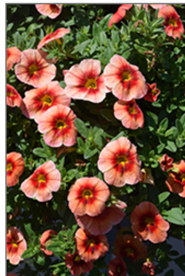
Eyeconic Peach Calibrachoa flowers

A stunning semi-trailing series presenting extra large, single blooms with contrasting eyes; pale peach flowers with intense red eyes cascade from deep green foliage during the summer months; ideal for containers and hanging baskets