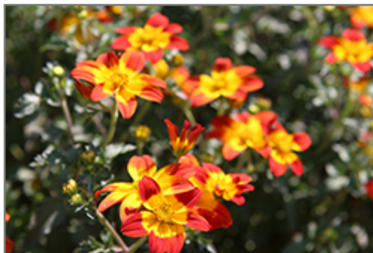
Bee Happy Red Bidens flowers