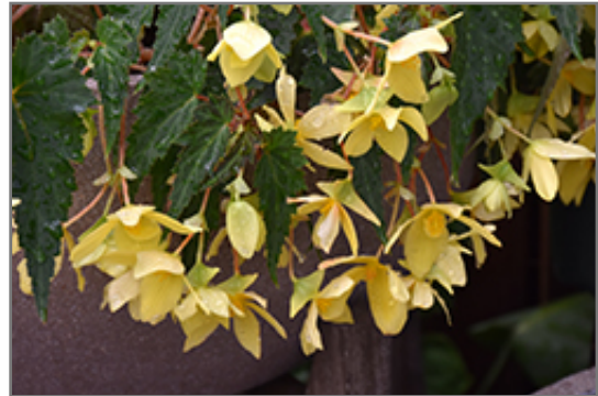
Copacabana Yellow Begonia flowers