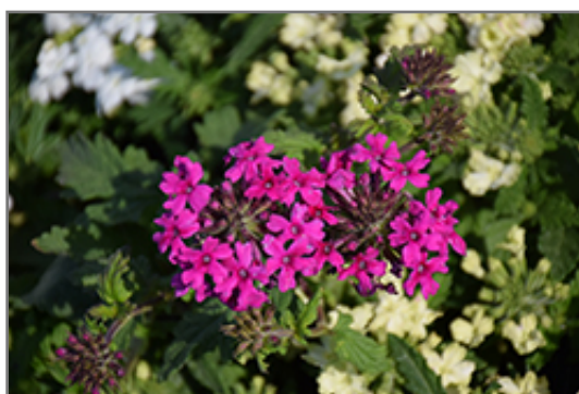
Homestead Hot Pink Verbena flowers