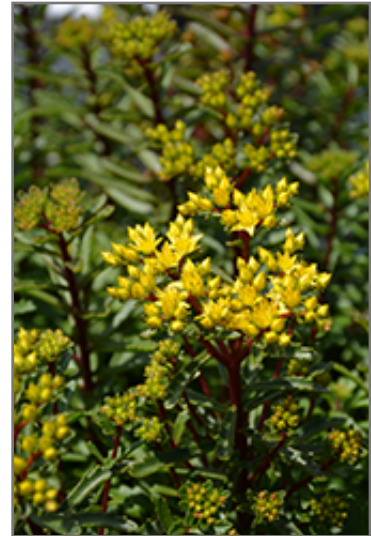
Yellow Diamonds Stonecrop flowers

Yellow Diamonds Stonecrop is recommended for the following landscape applications;