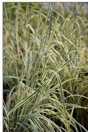
Shining Star Bluestem foliage Photo courtesy of NetPS Plant Finder

Shining Star Bluestem is recommended for the following landscape applications;