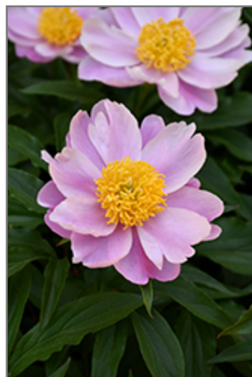
Chinese Peony flowers