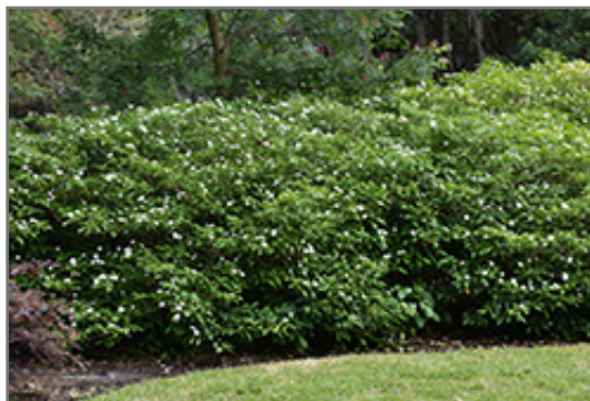
Crepe Jasmine in bloom

This is a relatively low maintenance shrub, and should only be pruned after flowering to avoid removing any of the current season's flowers. It is a good choice for attracting butterflies to your yard. It has no significant negative characteristics.