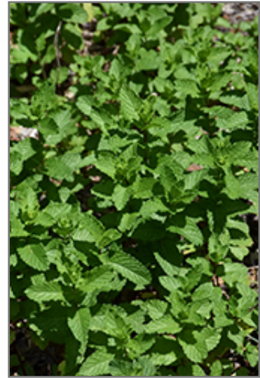
Apple Mint foliage

Apple Mint will grow to be about 3 feet tall at maturity, with a spread of 24 inches. When grown in masses or used as a bedding plant, individual plants should be spaced approximately 16 inches apart. Its foliage tends to remain dense right to the ground, not requiring facer plants in front. Although it's not a true annual, this fast-growing plant can be expected to behave as an annual in our climate if left outdoors over the winter, usually needing replacement the following year. As such, gardeners should take into consideration that it will perform differently than it would in its native habitat.