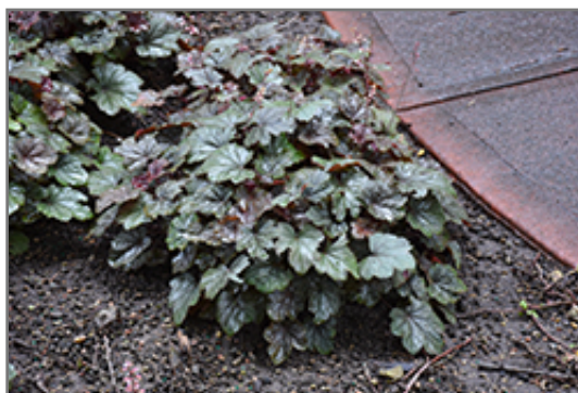
Steel City Coral Bells