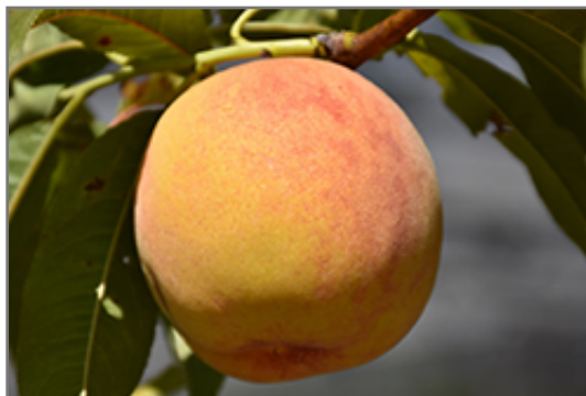
Reliance Peach fruit

Reliance Peach is clothed in stunning clusters of fragrant pink flowers along the branches in early spring, which emerge from distinctive rose flower buds before the leaves. It has dark green deciduous foliage. The narrow leaves turn yellow in fall. The fruits are showy yellow drupes with a red blush, which are carried in abundance in mid summer. The fruit can be messy if allowed to drop on the lawn or walkways, and may require occasional clean-up.