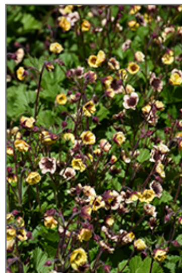
Tempo Yellow Avens flowers

Tempo Yellow Avens is recommended for the following landscape applications;