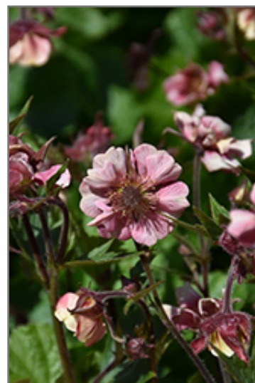
Tempo Rose Avens flowers