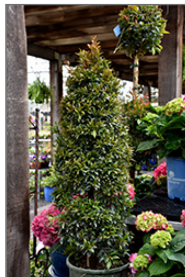
Dwarf Brush Cherry