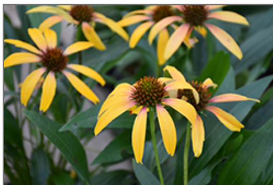
Fiery Meadow Mama Coneflower flowers