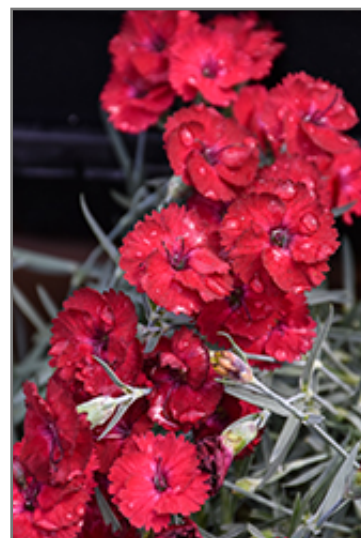
Mountain Frost Red Garnet Pinks flowers