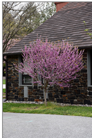
Kay's Early Hope Redbud in bloom