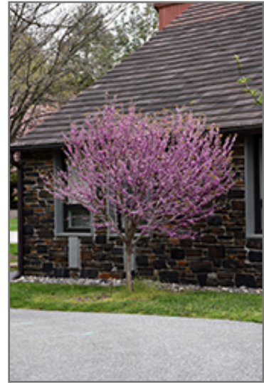
Kay's Early Hope Redbud in bloom