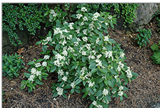
Snow Lace Dogwood in bloom