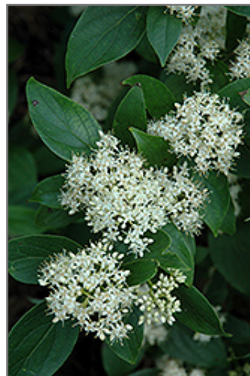
Snow Lace Dogwood flowers

Snow Lace Dogwood is recommended for the following landscape applications;