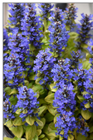
Feathered Friends Petite Parakeet Bugleweed flowers