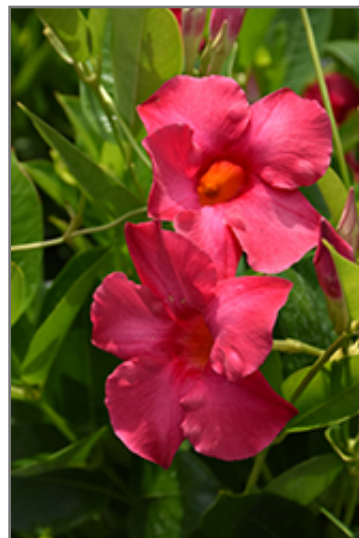
Tropical Breeze Raspberry Kiss Mandevilla flowers

This vigorous twining selection produces bold and tropical, raspberry pink trumpet flowers from spring to fall, over glossy green leaves; a lovely choice for trellises, garden fences or walls; excellent drought tolerance; prefers full sun