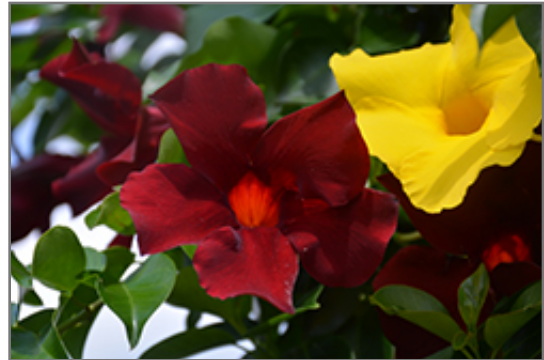
Diamantina Opal Merlot Mandevilla flowers

This plant is native to the tropics and prefers growing in moist environments with evenly warm conditions all year round. In our climate, it is usually grown as an outdoor annual in the garden or in a container. If you want it to survive the winter, it can be brought in to the house and provided with special care, and then returned to the garden the following season. In its preferred tropical habitat, it can grow to be around 5 feet tall at maturity, with a spread of 16 inches. However, when grown as an annual or when overwintered indoors, it can be expected to perform differently, and its exact height and spread will depend on many factors; you may wish to consult with our experts as to how it might perform in your specific application and growing conditions.