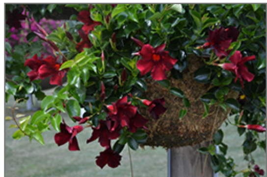
Diamantina Opal Merlot Mandevilla flowers