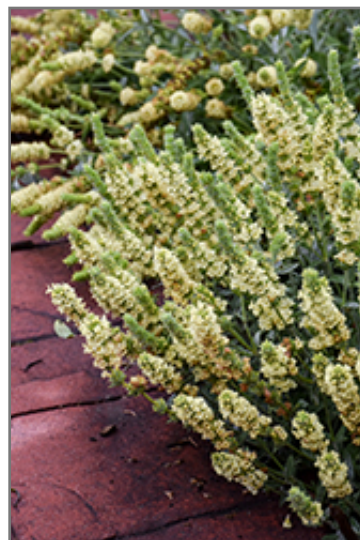
Ironwort flowers