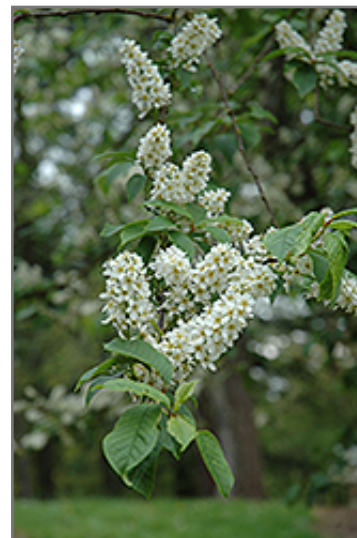
Mayday flowers

Mayday is recommended for the following landscape applications;