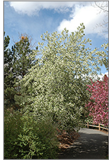
Mayday in bloom

This tree should only be grown in full sunlight. It does best in average to evenly moist conditions, but will not tolerate standing water. It is not particular as to soil type or pH. It is highly tolerant of urban pollution and will even thrive in inner city environments. This species is not originally from North America.