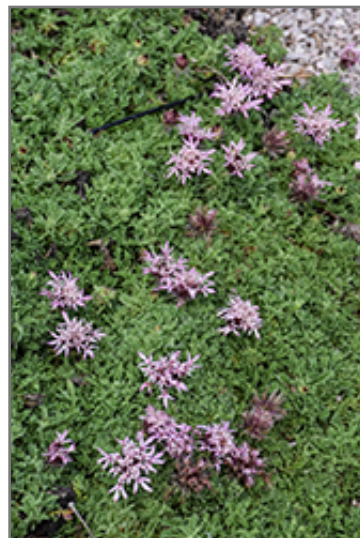
Carpeting Pincushion Flower in bloom

This is a relatively low maintenance plant, and is best cleaned up in early spring before it resumes active growth for the season. It is a good choice for attracting bees and butterflies to your yard, but is not particularly attractive to deer who tend to leave it alone in favor of tastier treats. It has no significant negative characteristics.