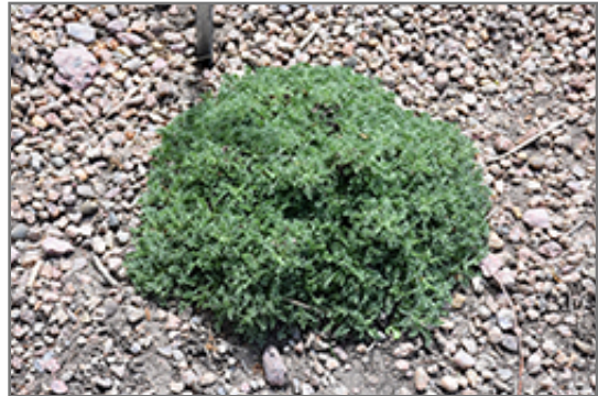
Carpeting Pincushion Flower

This plant is not reliably hardy in our region, and certain restrictions may apply; contact the store for more information.