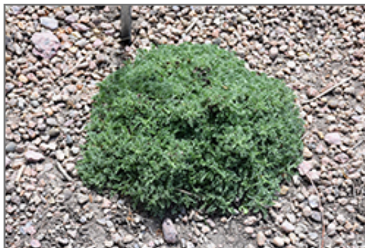
Carpeting Pincushion Flower

This plant is not reliably hardy in our region, and certain restrictions may apply; contact the store for more information.