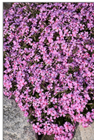
Eye Candy Creeping Phlox in bloom

Eye Candy Creeping Phlox is recommended for the following landscape applications;