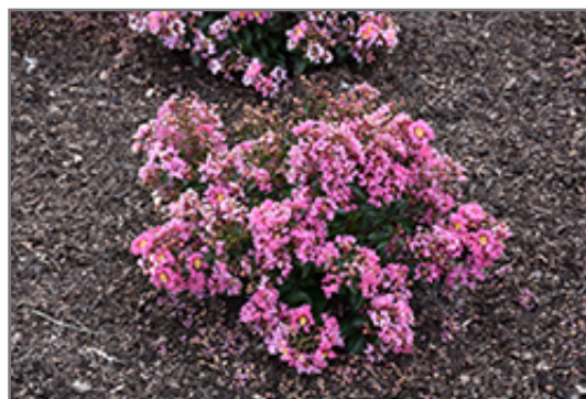
Barista Peppermint Mocha Crapemyrtle in bloom