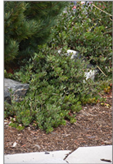
Chieftain Manzanita

Chieftain Manzanita is recommended for the following landscape applications;