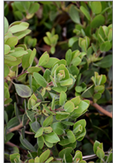
Chieftain Manzanita foliage

This plant is not reliably hardy in our region, and certain restrictions may apply; contact the store for more information.