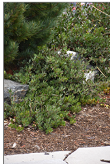
Chieftain Manzanita

Chieftain Manzanita is recommended for the following landscape applications;