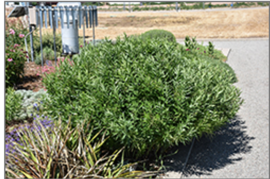
Jones' Bluestar

Jones' Bluestar will grow to be about 12 inches tall at maturity, with a spread of 12 inches. When grown in masses or used as a bedding plant, individual plants should be spaced approximately 10 inches apart. It grows at a slow rate, and under ideal conditions can be expected to live for 40 years or more. As an herbaceous perennial, this plant will usually die back to the crown each winter, and will regrow from the base each spring. Be careful not to disturb the crown in late winter when it may not be readily seen!