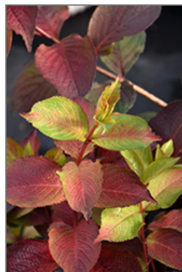
Midnight Sun Reblooming Weigela foliage