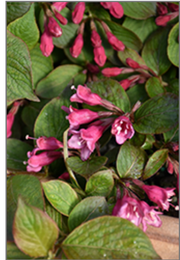
Midnight Sun Reblooming Weigela flowers

This plant is not reliably hardy in our region, and certain restrictions may apply; contact the store for more information.