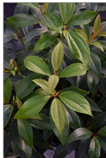
Yang Viburnum foliage