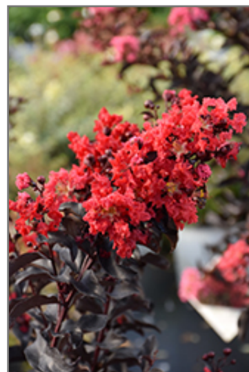
Center Stage Red Crapemyrtle flowers