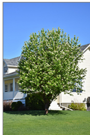
Amur Cherry