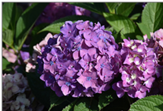
Let's Dance Arriba! Hydrangea flowers

Let's Dance Arriba! Hydrangea is recommended for the following landscape applications;