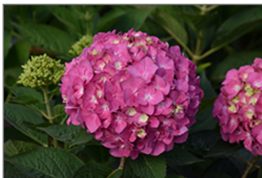
Let's Dance Arriba! Hydrangea flowers