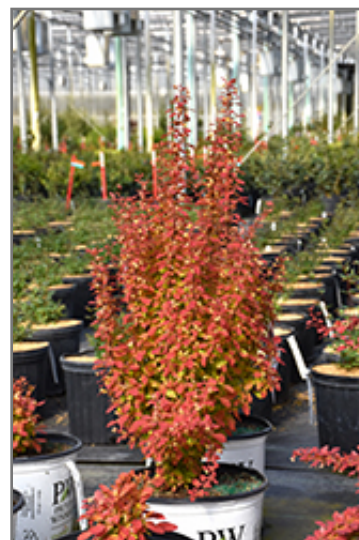
Sunjoy Orange Pillar Japanese Barberry