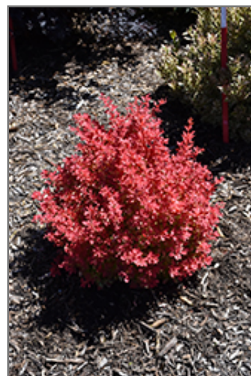
Sunjoy Neo Japanese Barberry

This plant is not reliably hardy in our region, and certain restrictions may apply; contact the store for more information.