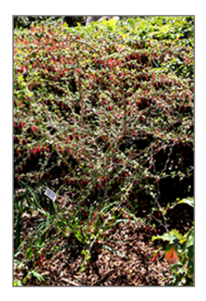
Fuchsia-flowered Gooseberry in bloom