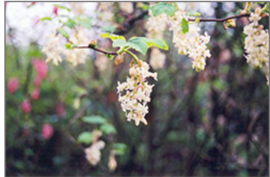
Album Winter Currant flowers

Album Winter Currant will grow to be about 8 feet tall at maturity, with a spread of 7 feet. It tends to be a little leggy, with a typical clearance of 1 foot from the ground, and is suitable for planting under power lines. It grows at a medium rate, and under ideal conditions can be expected to live for 40 years or more.