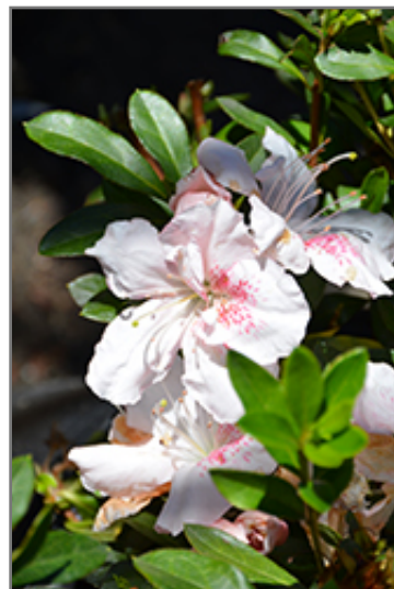
Nuccio's Melody Lane Azalea flowers

Nuccio's Melody Lane Azalea will grow to be about 4 feet tall at maturity, with a spread of 3 feet. It tends to be a little leggy, with a typical clearance of 1 foot from the ground. It grows at a slow rate, and under ideal conditions can be expected to live for 40 years or more.